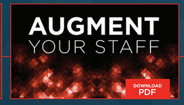
Augment your staff white paper